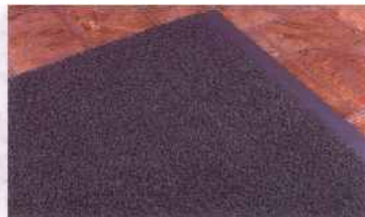
3M™ Nomad™ Entryway System