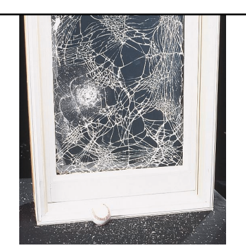
With safety and security window film

The general rule is the thicker the film, the stronger the film. But that's not always the case. What's crucial is impact- and tear-resistance. And 3M's got the best.