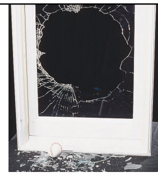
Without safety and security window film

Made of an exceptionally tough polyester, 3M<sup>™</sup> Scotchshield<sup>™</sup> Safety and Security Window Film is secured to the inside of windows with an aggressive adhesive system. It helps hold glass together, deterring smash-and-grab burglars and reducing the chance of glass shards falling or flying out.