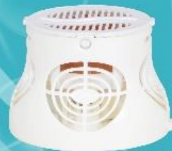
POD air freshener dispenser