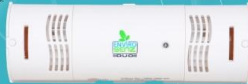
DUO air freshener dispenser