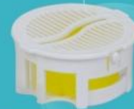
DUO air freshener refill

Deodorizes up to 6,000 cubic feet of space