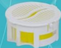
POD air freshener refill